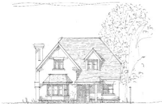
CHALET BUNGALOW STYLE FAR RIGHT OF DEVELOPMENT

Beaulieu Homes Limited 38 Station Road, Wokingham Berkshire RG40 2AE. Telephone: 0118 978 7957 Email: info@beaulieuhomes.co.uk www.beaulieuhomes.co.uk